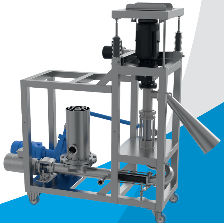
A complete GEA vaculiq 100 unit pre-mounted on a mobile, ready-to-juice skid with all connections, fittings and controls