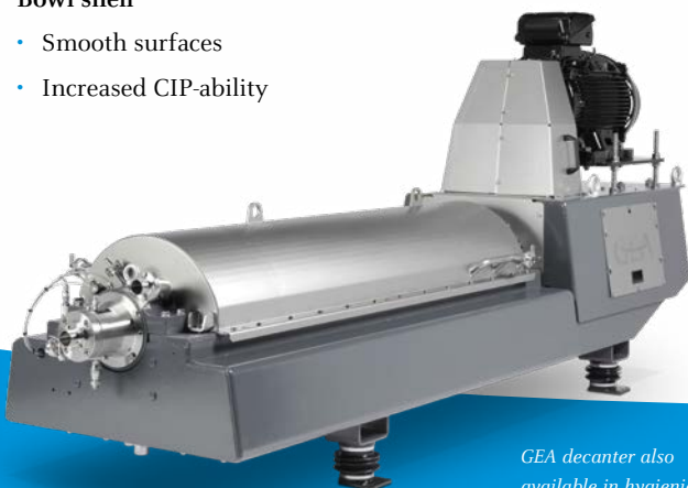
GEA decanter also available in hygienic design